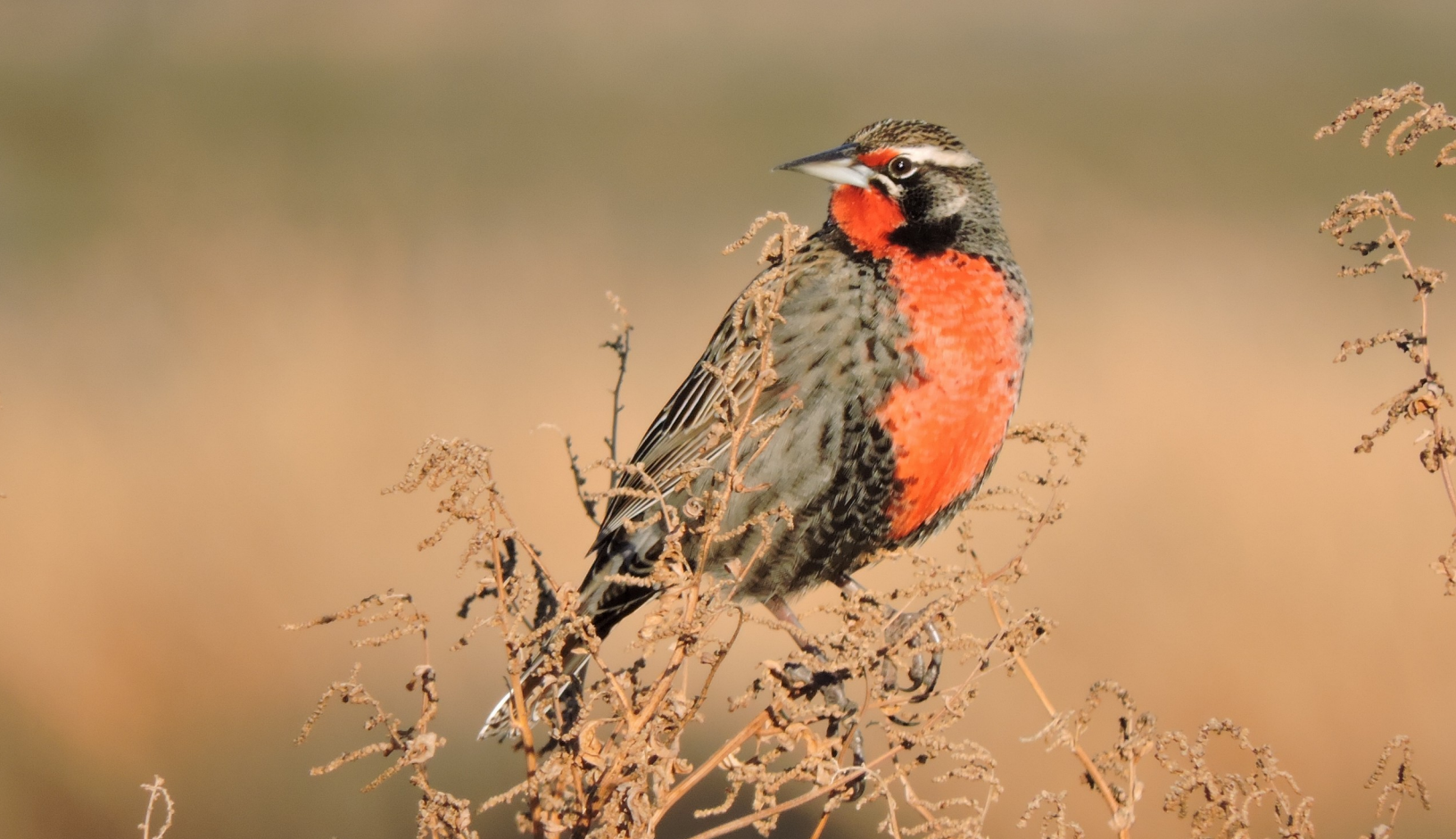
Long-tailed Meadowlark – © Marcelo Gavensky