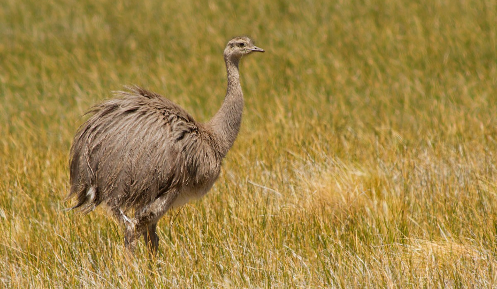
Lesser Rhea