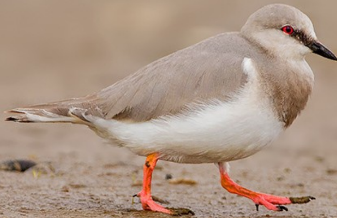
Magellanic Plover