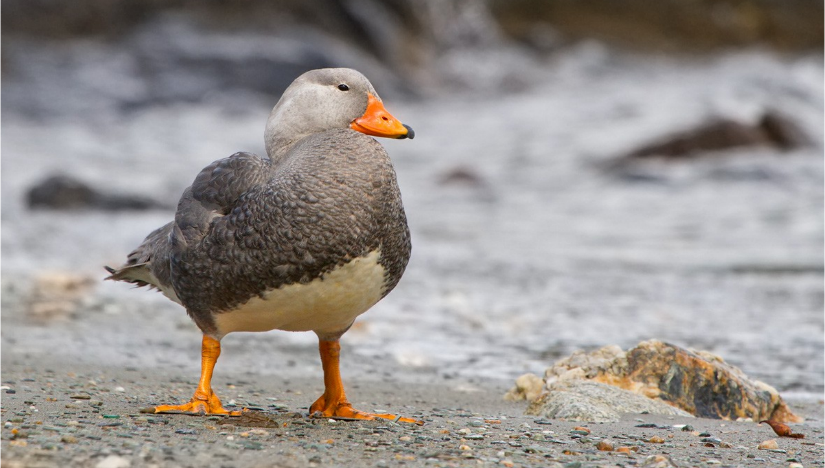
Flightless Steamer-Duck

DAY 3: Full day birding tour to the Patagonian steppe. Night in El Calafate.