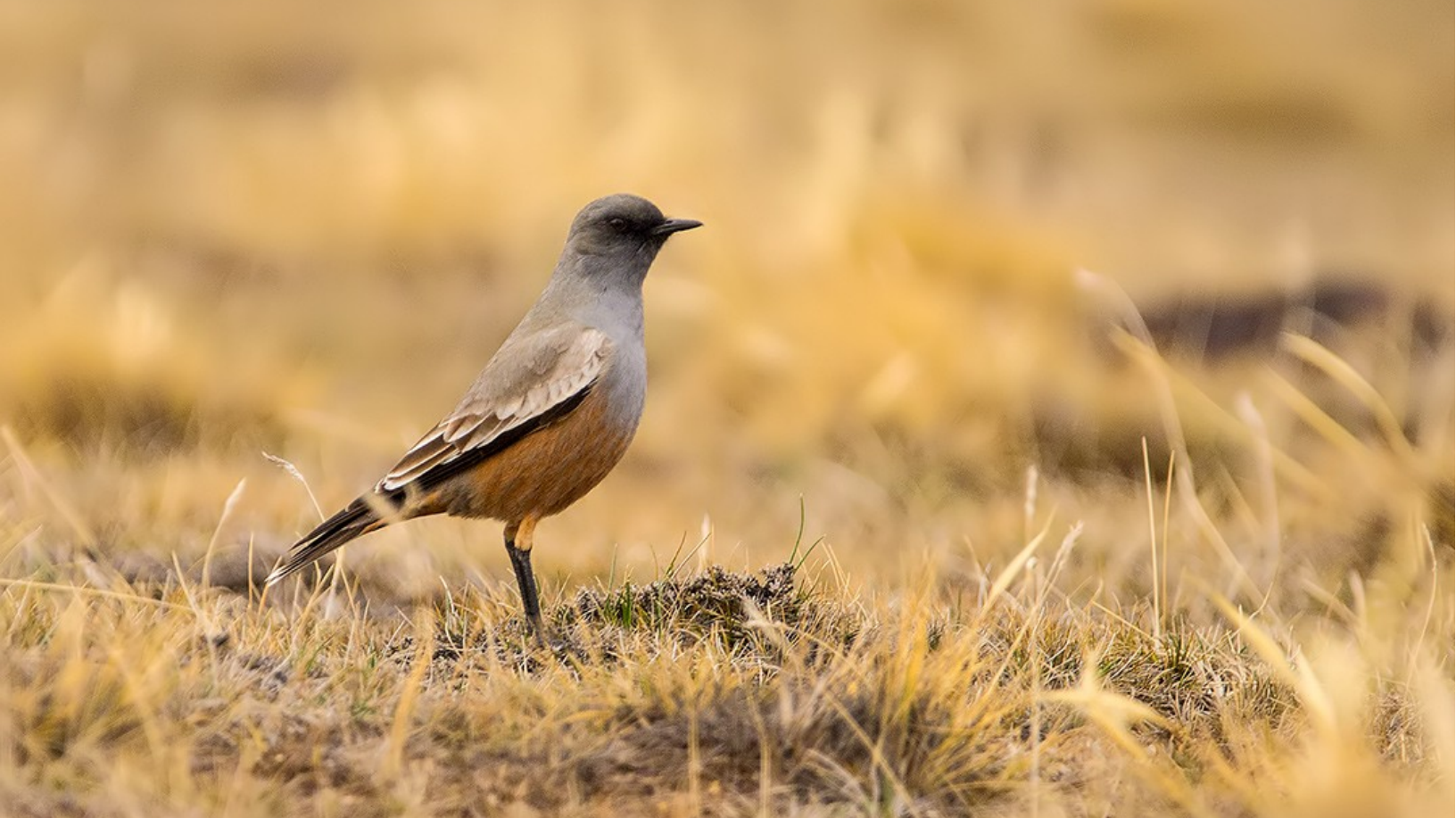
Chocolate-vented Tyrant

From El Calafate we will take a PM flight to Ushuaia, where we will make check in at the hotel and have a first walk in the surroundings, along the coast of the Beagle channel, looking for species such as Kelp Goose , Dolphin Gull , Dark-bellied and Buff-winged Cinclodes .