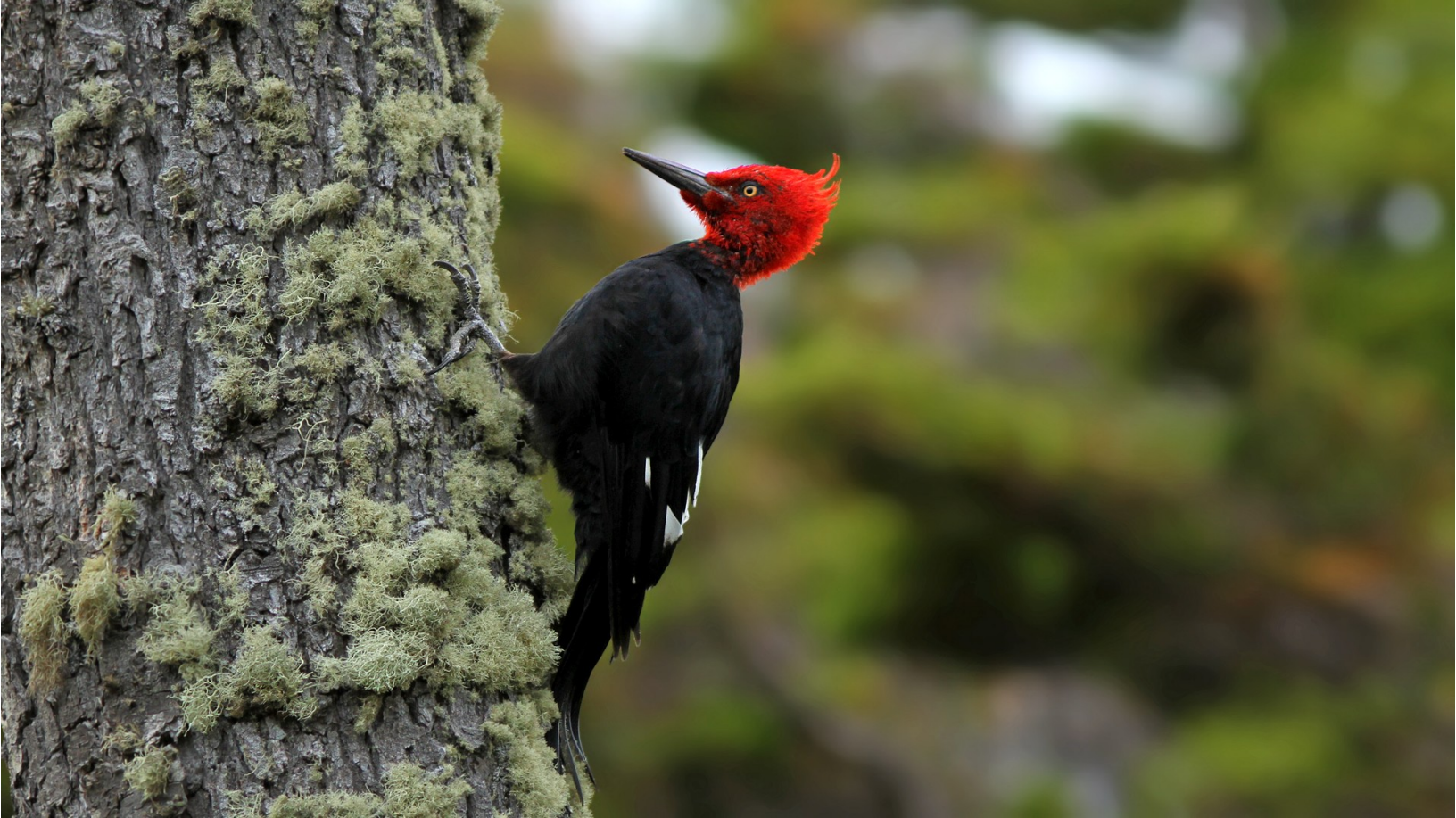
Magellanic Woodpecker