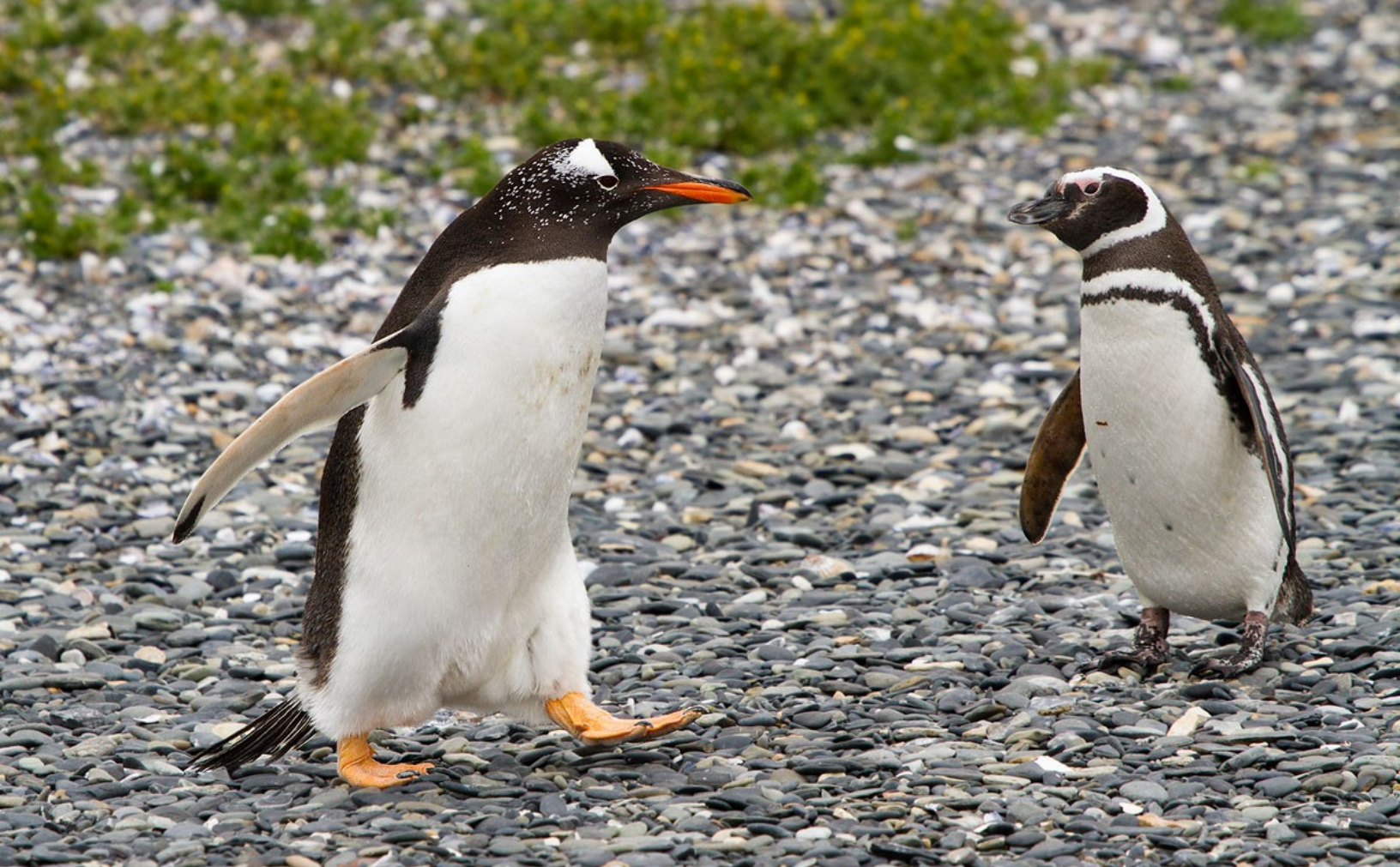
Gentoo and Magellanic Penguins in Isla Martillo

Megellanic and Gentoo Penguins. If we are lucky we might get a third species of penguin, as some King Penguins use the island for moulting at times. During the navigation we will have chances for better views of Black-browed Albatross, Southern Giant Petrel and some other less common species such as Magellanic Diving-Petrel and Southern Fulmar. South American Sea Lion and South American Fur Seal are among the marine mammals that we would be seeing during the trip.