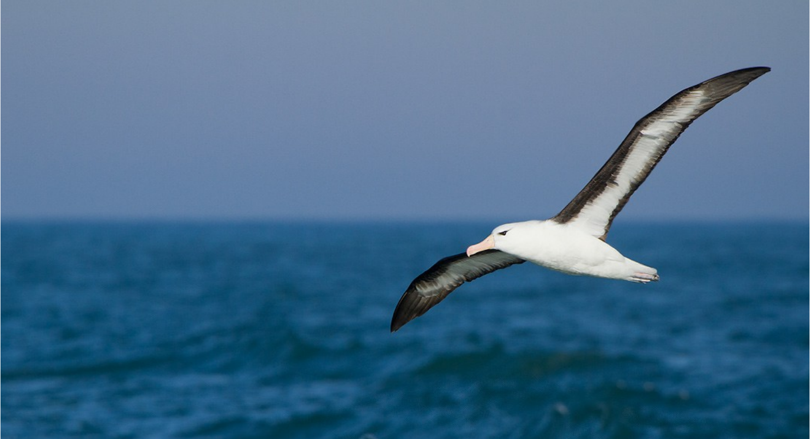
Black-browed Albatross - © Jorge La Grotteria