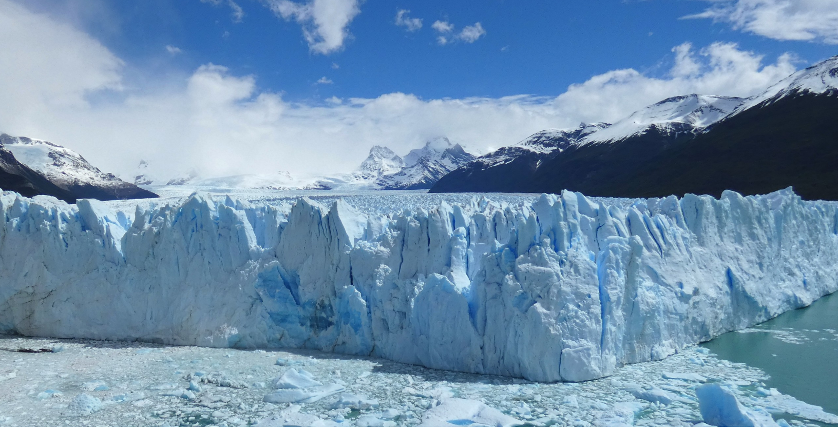
The breathtaking Perito Moreno glacier