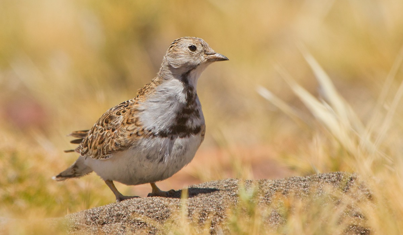
Least Seedsnipe

Patagonian Sierra-Finch, Black-chinned Siskin, Austral Blackbird and more. In the transitional area we will be looking for Chilean Flicker, Pallid Tit-Spinetail, Tufted Tit-Tyrant and Rufous-tailed Plancutter . We will also have chances of seeing Spectacled Duck in the wetlands of the area.